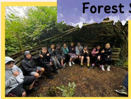
Bush Craft and Forest Schools