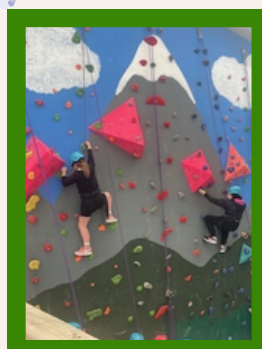
In door rock climbing